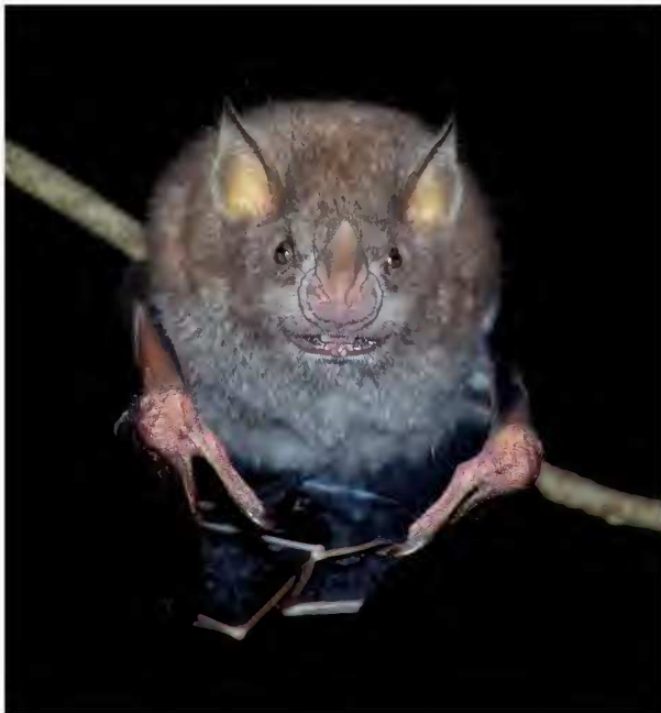
Figure 6. Photograph of a female Ardops nichollsi from the edge of the crater of The Quill on St. Eustatius. Note the large, complex nose-leaf, the white shoulder spot that is visible above the left wing, and the long, grayish pelage characteristic of this species.

Remarks. —Previously, Jones and Schwartz (1967) recognized five subspecies of Ardops nichollsi , where the subspecies montserratensis was comprised of individuals of Ardops nichollsi from Montserrat and St. Eustatius (Fig. 6). Subsequently, this subspecies was reported from Saba (Genoways et al. 2007a), St.